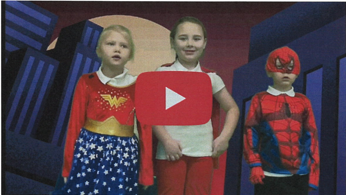
ONE Trust Key Stage 1 Safer Internet Day video

Our Harnessing Technology group brings together all of the computing leads from across our schools. As well as the staff sharing their knowledge and expertise around best practice in curriculum delivery, they also organise fantastic events for the pupils to participate in. This term, some of the children in Key Stage One took part in an online safety video in the lead up to Safer Internet Day. The children were brilliant and were so excited to perform, read their lines, and raise awareness about how to stay safe online.